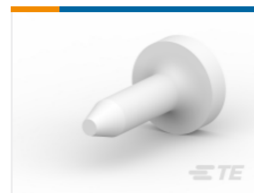
TE Part # 206509-1 SIZE 20 KEYING PLUG