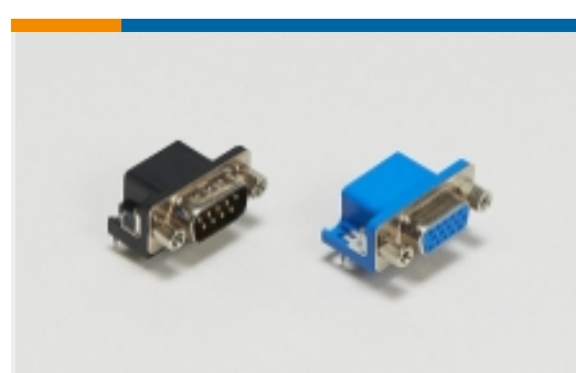
PCB D-Sub Connectors(354)