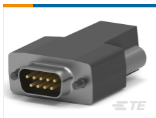
TE Part # 1-747944-6 KIT, PLUG, 9P, HDE, SHLD ENCL SRE