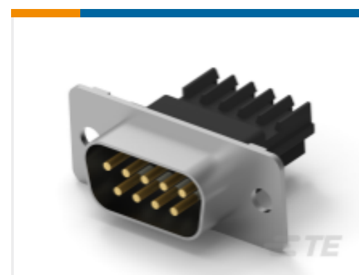
TE Part # 2-745492-0 PLUG ASSY, 9P, HDE, MS