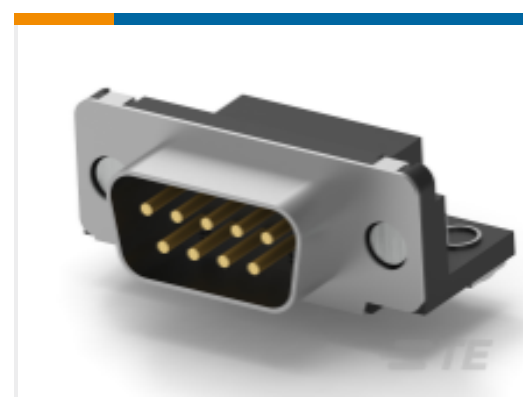
TE Part # CAT-023-DPARS1274 D-Sub Plug Assembly: Standard, Right Angle, Shell Size 1, 2.74mm